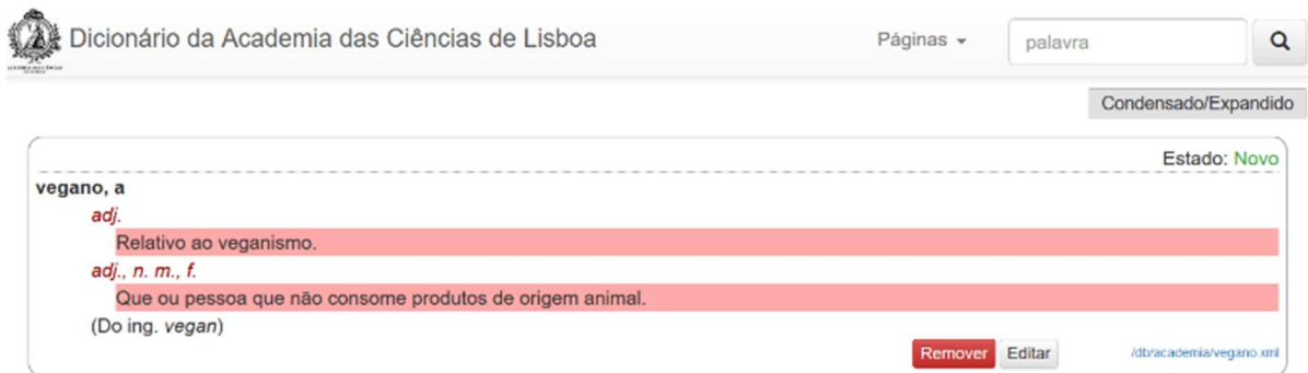
Figure 3: vegano [vegan] (DACL new edition).

In these cases, the gramGrp element stores a list of possible gram entries, one for each analysis. This mapping was defined manually as a table, and the conversion script simply replaced the existing information with the new one.