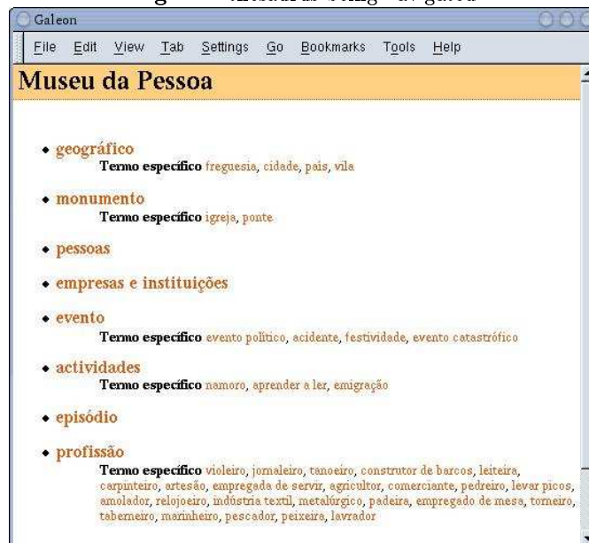
Fig. 1. A thesaurus being navigated