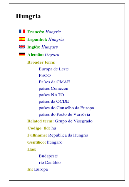
Figure 3: Ontology HTML view

In our experiments, the use of a few word lists, thesauri and multilingual terminologies resulted in a dictionary with about 100 000 entries. The tool also creates the 100 000